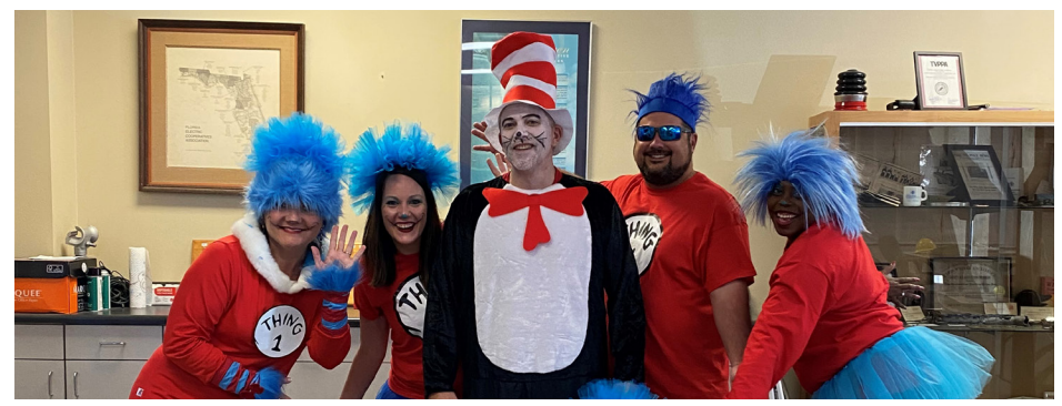
Employees dress up as Dr. Seuss-themed characters for Halloween fundraiser.

Another new year is upon us, and we hope to finally return to hosting our usual events this year after a twoyear break due to COVID-19. We have a lot planned for 2022, but we also accomplished quite a bit in 2021.